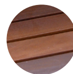
tropical wood FSC