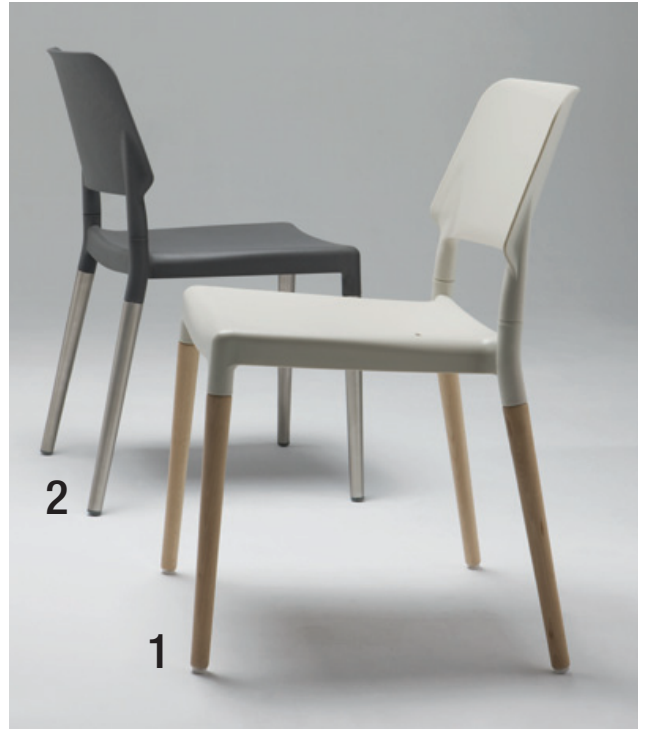
(1.) Belloch chair with beech wood legs . (2.) with aluminium legs