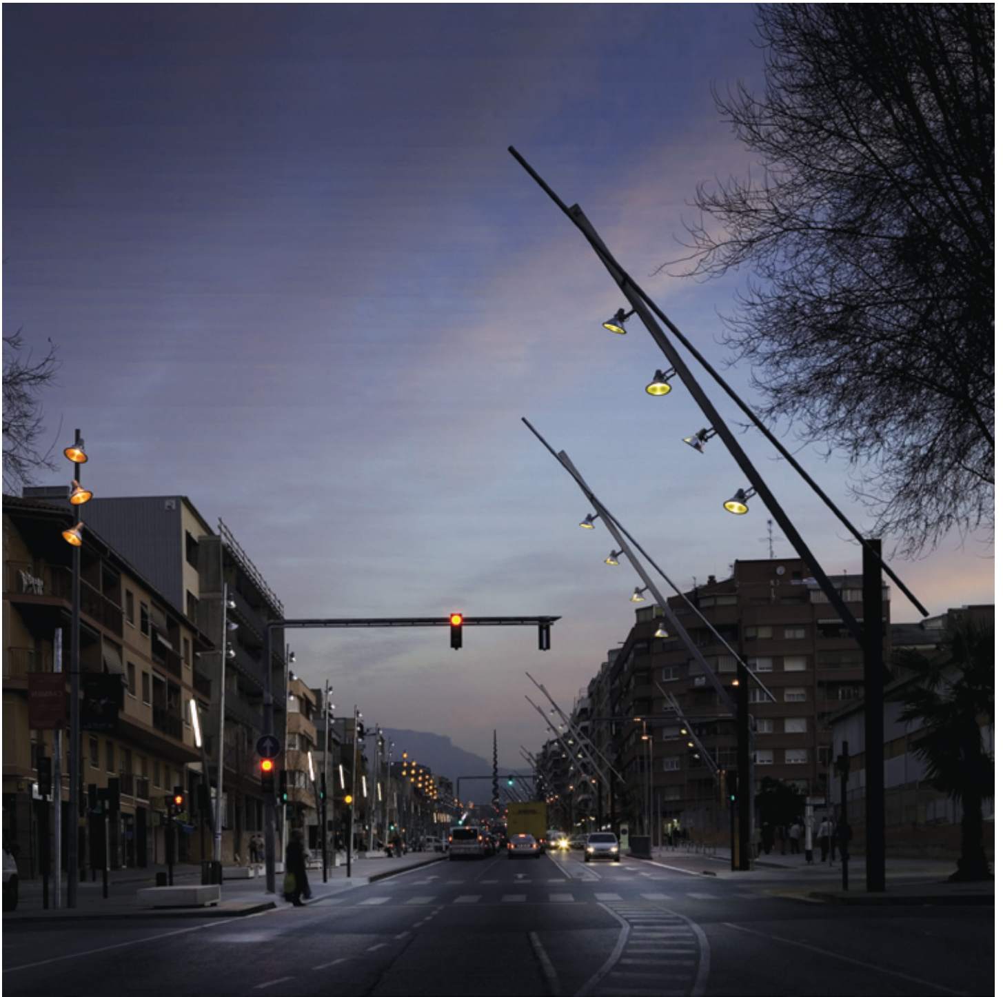
Barcelona Avenue, Terrassa (Spain)