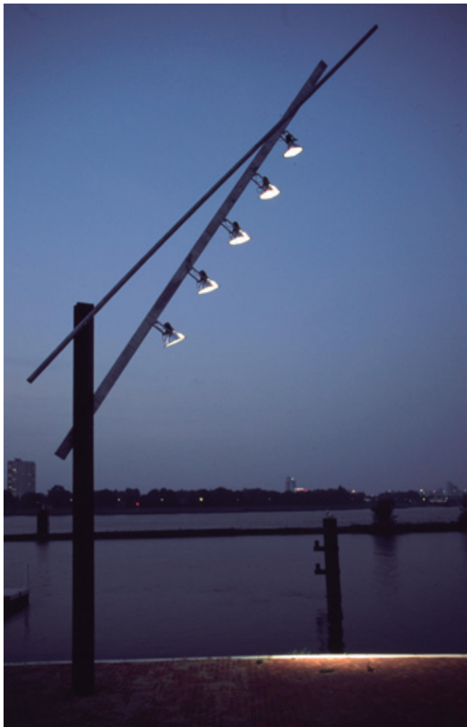
Piet Smit Terrain, Rotterdam (Netherlands)