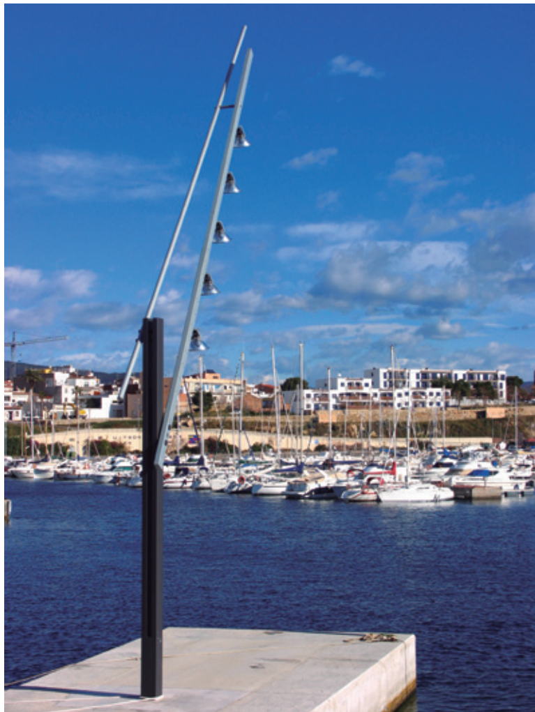
Marina Palamós Port, Girona (Spain)