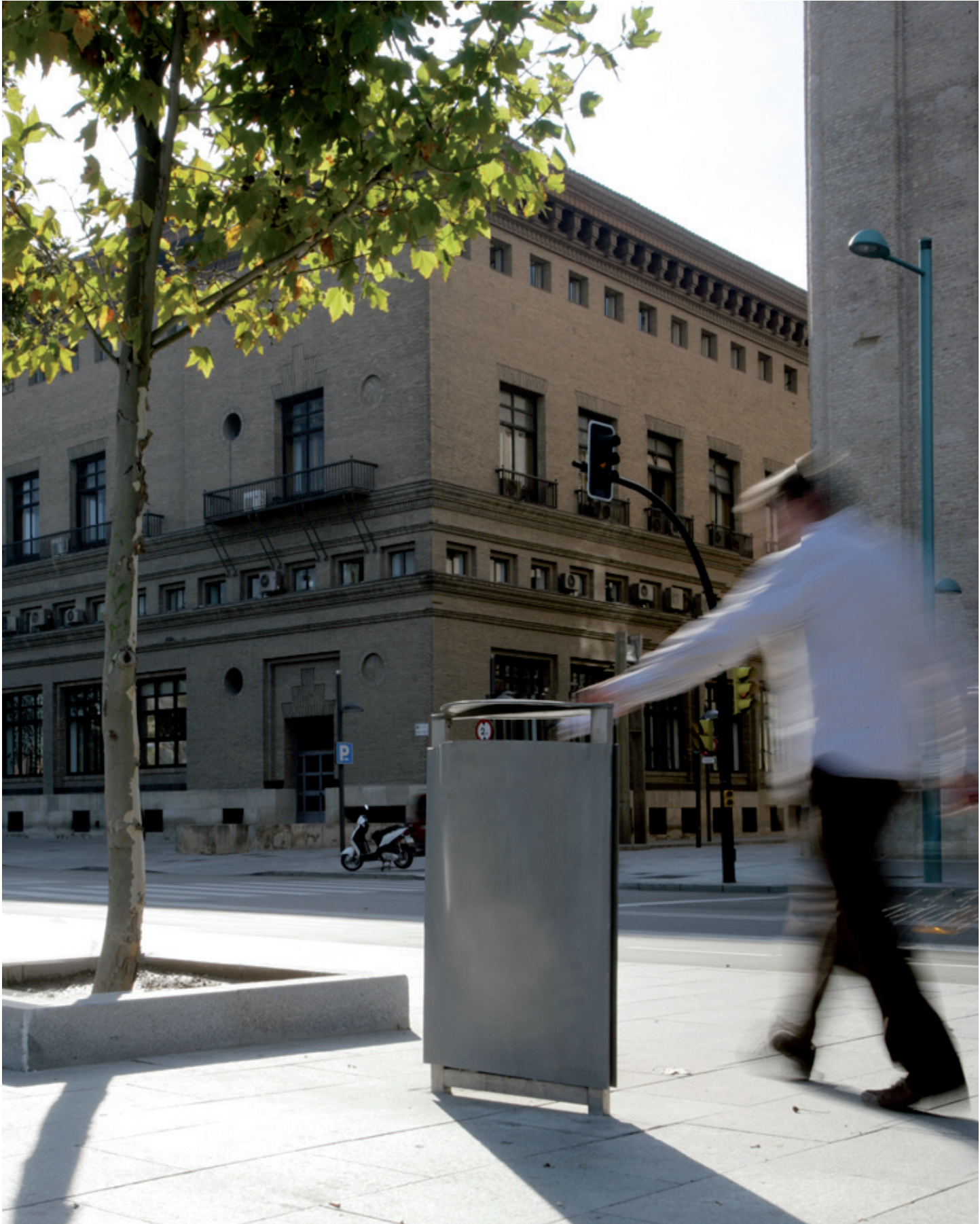
Banks of the River Ebro, Zaragoza (Spain)