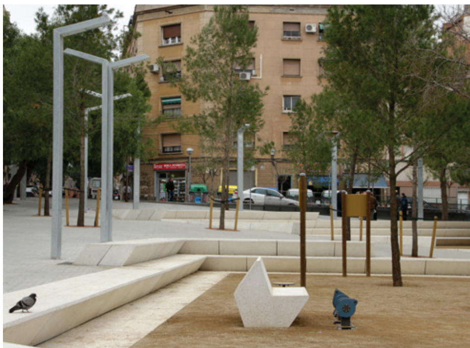
Ocellets Park, Barcelona (Spain)