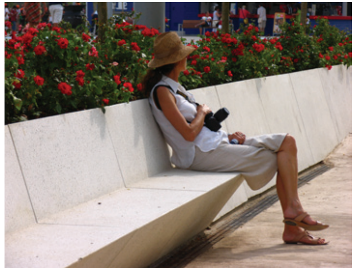
Expo Zaragoza 2008, Zaragoza (Spain)

DESIGNED TO SHAPE LIMITS, ENCLOSE LAND AND FORM ALIGNMENTS